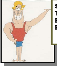
STUMP THE PUMP BOY