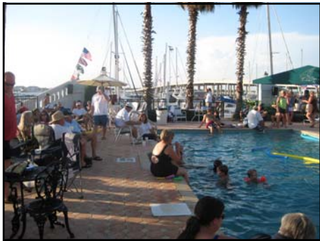
4th July Luau—Lots of food, Steel Drum music, Tiki Bar, Fire works and Good times...